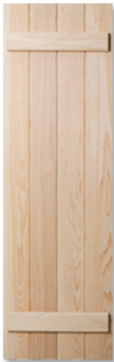
Board & Batten Closed

THE DESIGN PROCESS: Our salesmen/designers have the knowledge and experience to design each individual shutter panel for optimum appearance, fit, finish and function. Every element is custom. Stiles and rail sizes are determined based on shutter width, height, louver spacing and existing window mullions. Appropriately designed frames, hanging strips and hardware finishes are selected. We not only build the shutters to your exact specifications, but we finish them to your specifications too.