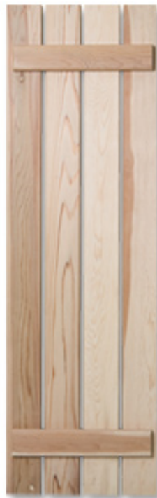
Board & Batten Open